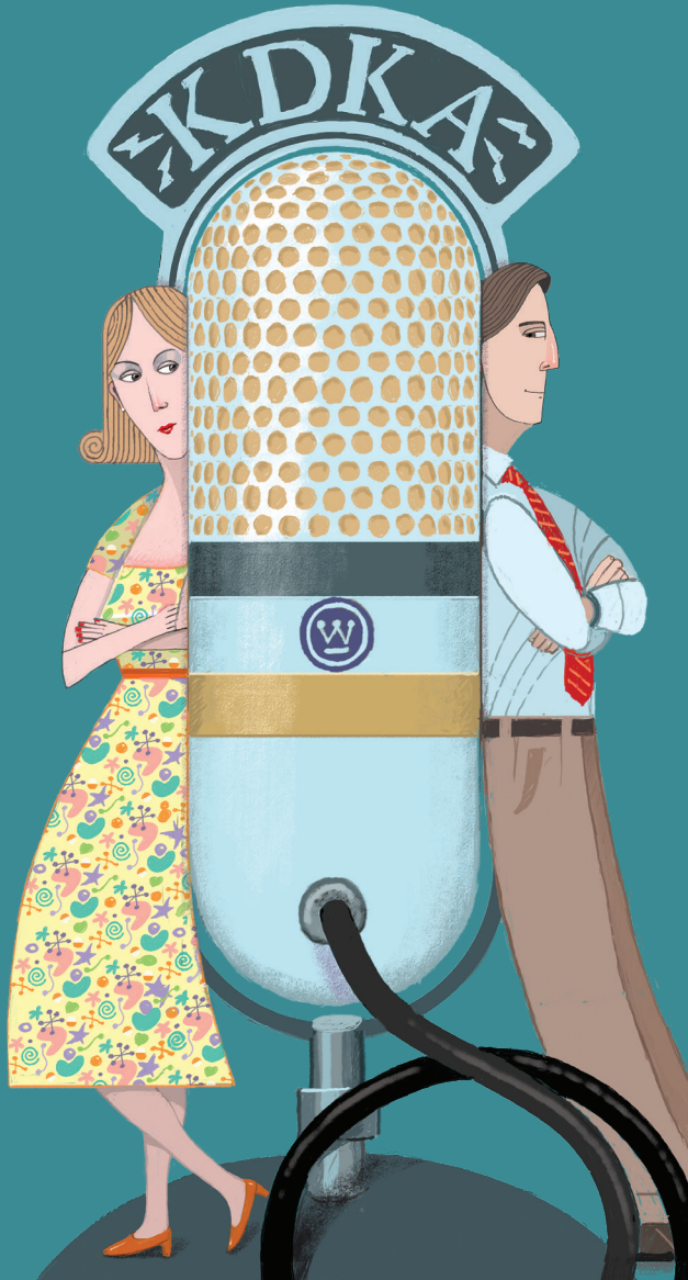
ILLUSTRATION BY ROBERT MEGANCK