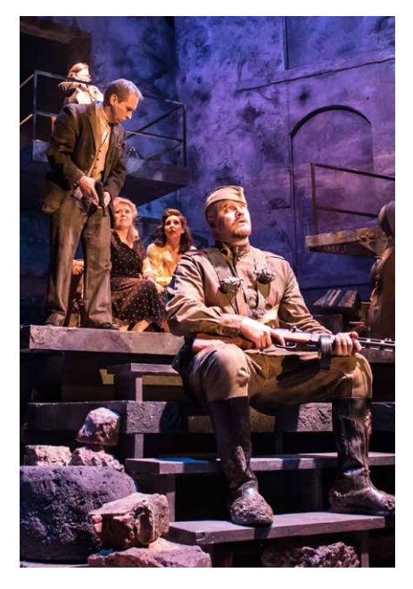
The cast of End of War.